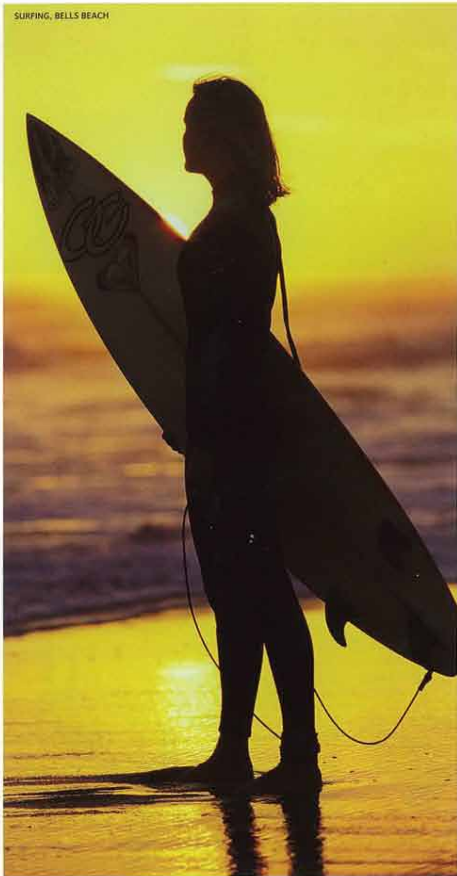
SURFING, BELLS BEACH

"When I choose to head to the Murray it's to be still and be near the water. I'm usually in need of some down time and I could happily just sit by the Murray all day. I enjoy bush cooking and I'm happy with one pot, one pan and some good wine or beer."