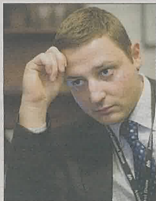
Chance: Merrick Watts.

The Merrick and Rosso Show premieres at 8.40pm on October 2.