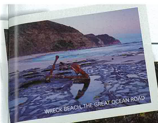
WRECK BEACH, THE GREAT OCEAN ROAD

"Everybody has been so supportive and encouraging. The way I see it is that I've had the opportunity to have strangers give me well wishes. They say that there are no strangers,