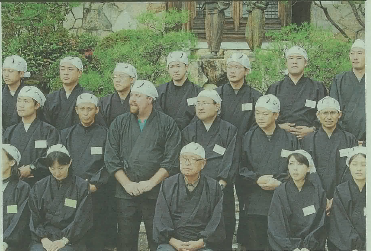
Kenny (Shane Jacobson, centre), learns humility through a toilet-cleaning ritual in Kyoto, Japan (above). Left, Shane with the director of Kenny's World, his brother Clayton.

working to find their niche in showbiz from early on. For Clayton, it was behind the scenes, as a director of just about every Australian video clip made in the 1980s.